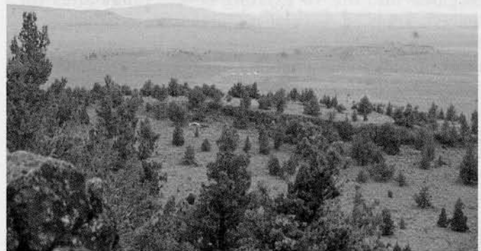
Northern Great Basin Experimental Range photo illustrating the variability and connectivity of habitat and productivity within a single management unit.

In developing grazing management plans for livestock, a critical step is to estimate carrying capacity and then set stocking rates, integrating both animal performance and vegetation management objectives. The challenge is to set the spatial scale small enough to identify areas with unique production or ecological properties and large enough for cost-effective implementation of decisions. We examine two perspectives: one in which ad-