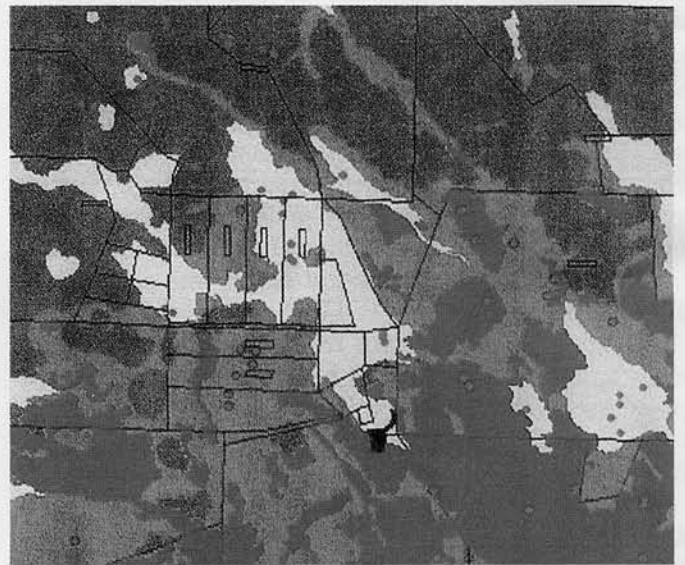
Figure 3. Aggregation of range sites into four production groups based on current standing crop, historical data, and expert opinion.

This approach allows for retention of basic information (soil map units and range sites) in case it is needed in the future, while still providing reasonably scaled management delineations. With spreadsheet-type software it is easy to combine units, and if necessary, recombine according to different criteria (production, seasonality, dominant species etc) if the original decisions