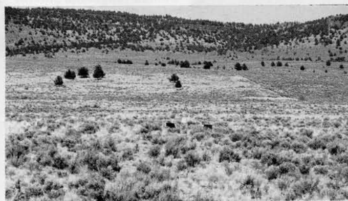
Northern Great Basin Experimental Range photo illustrating the importance of spatial position on the process of shrub increase as invasive plants move from higher elevation rocky outcrops onto lowlands.

Ranchers must make many decisions without the aid of sophisticated tools, using a qualitative, expert appraisal of the lay of the land beyond the community scale: A fence down a ridge to separate two drainages; a seeding on ground gentle enough to till; a water development located at the junction of several pastures; a riparian fence protects a river while continuing to allow a meadow to be hayed. All of these activities require a wide variety of information rather than just descriptions at one spatial scale.